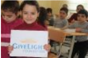
Syria Education Campaign