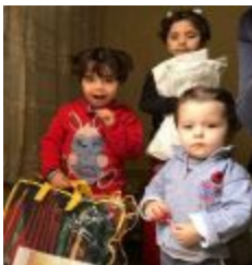
Syria Blanket Campaign