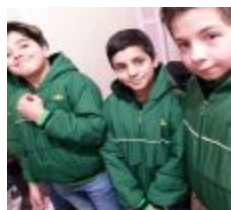
Winter Jackets Campaign