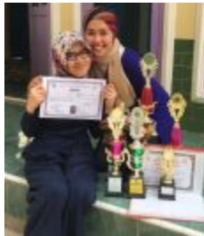
Aceh Student Awards