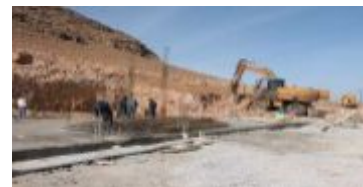
Morocco Home Construction in Progress